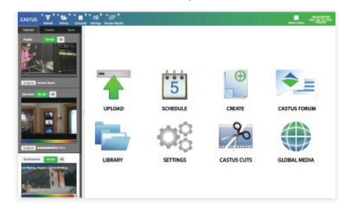
Web browser based user interface.