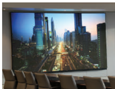
Gilead Pharmaceutical UPanelS 0.9mm