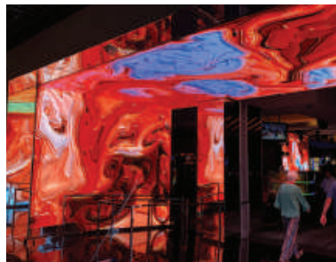
The LINQ Hotel & Casino Uslim 2.6mm