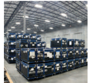
35,000 sq ft US Service Center

UPanelS mechanical design provides the capability to mount directly onto a load bearing flat wall without the need of a high cost 3rd party custom mount solution. Rated at 100K+ hours, you are guaranteed a longer life expectancy than that of traditional flat panel displays or DLP projection technologies that are typically used in large format video wall arrays.