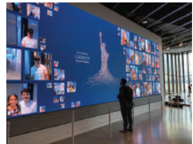
Statue of Liberty UPanelS 1.5mm