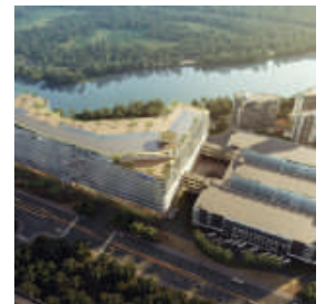
Over 290,000 sq ft Production Base