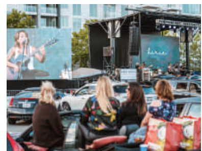
FEED THE NEED Drive-In Concert UtileIII 4.8mm Outdoor