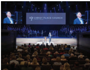
Christ Place Church UPadIII