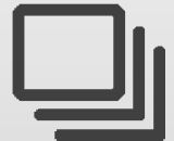
FRAME RATE CONVERSION