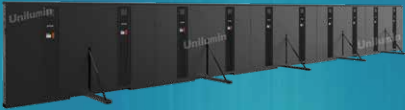
Seat Mounting Fence Screen