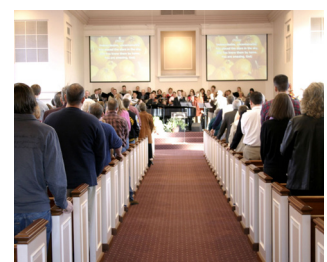
House of Worship